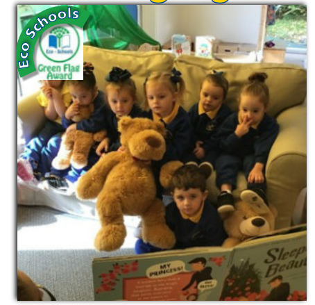
Teaching and Learning Phonics Page 7