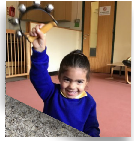
Children's Centre Activities Timetable Page 13