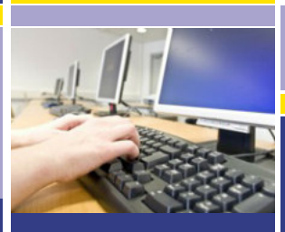
12.30pm – 2.30pm ICT Course IT course for all abilities delivered by EDT.