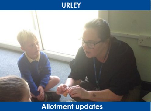
Indoor Heuristic Play