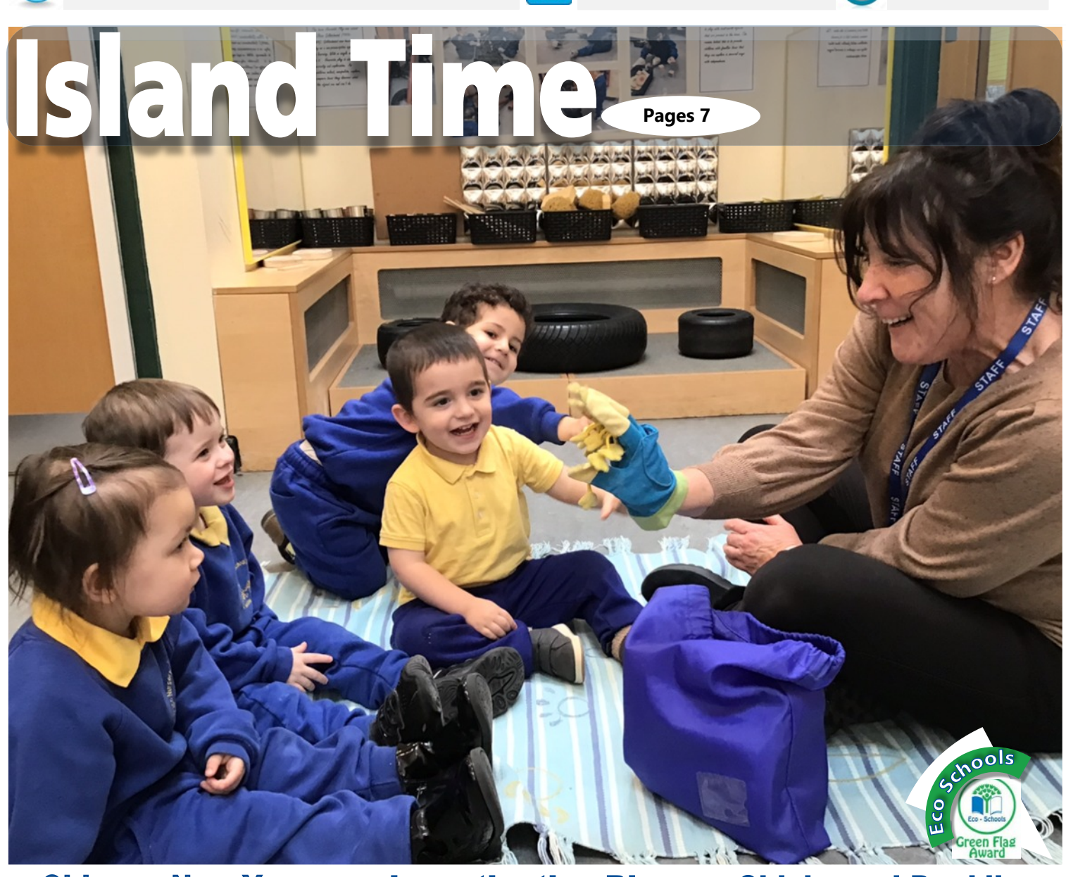
Chinese New Year Page 5+6