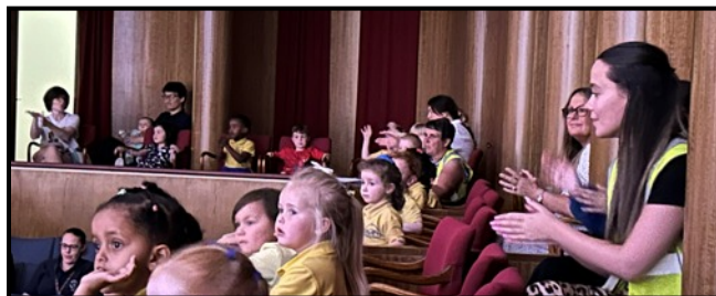
Liverpool Philharmonic P5+6