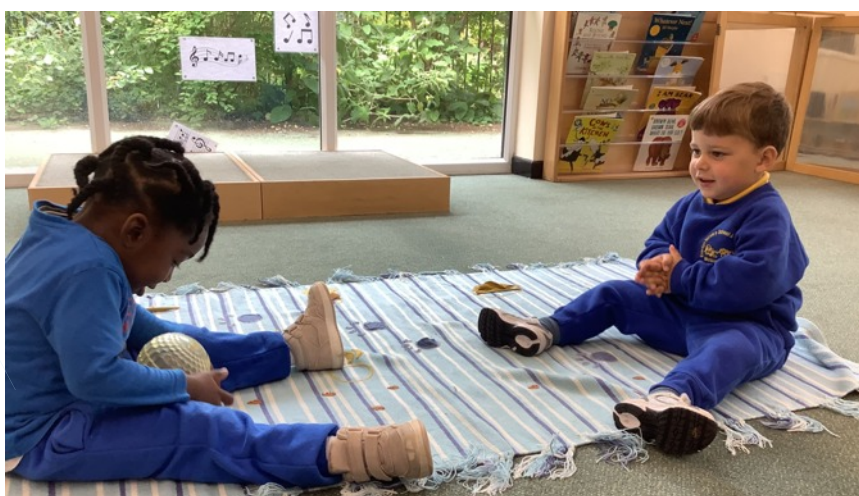
9+10 Island Time