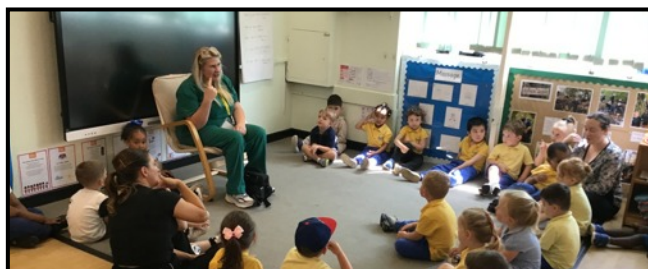
Learning about occupations P14