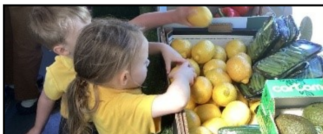
Queen of Greens P13