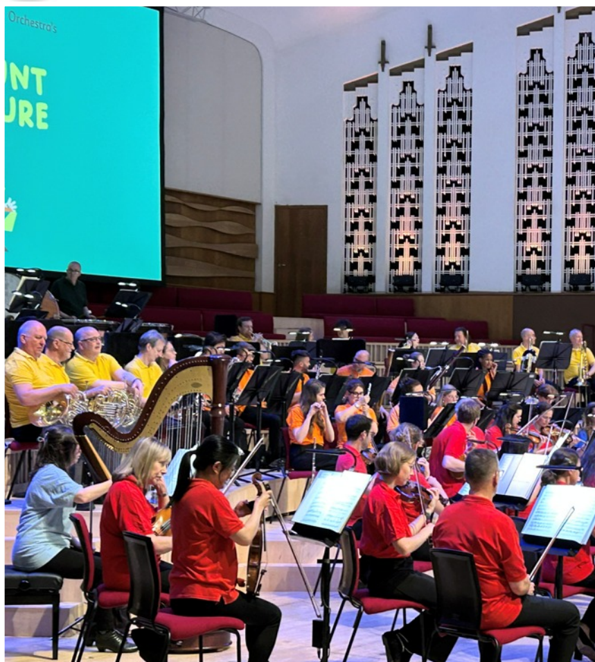
5+6 Liverpool Philharmonic