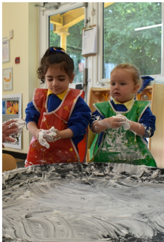
11+12 Learning Journey

The Queen of Greens stops at 40 communities bringing affordable fresh fruit, vegetables and eggs into the heart of local communities.