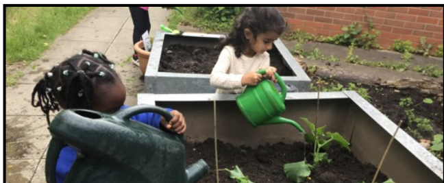
School Allotment P7+8