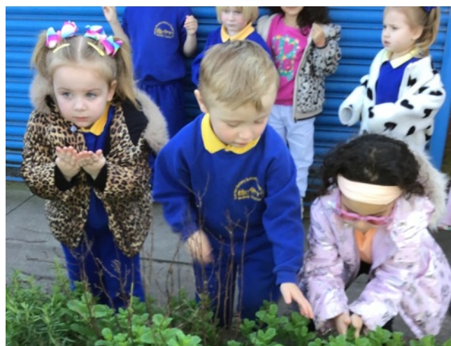
7+8 School allotment